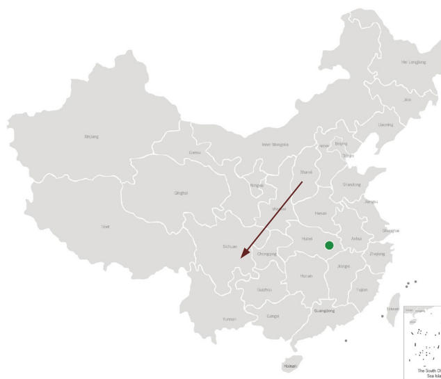
Wuhan, Hubei province

As an economic center and mega city in China's central region, with its particular geography and climate, Wuhan has long been an energy-intensive city. However, given its high dependency on energy imports and increasingly severe environmental constraints, it is inevitable that it will adopt a low-carbon development path.