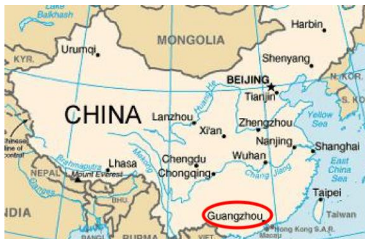
Figure 2: Location of Guangzhou in China

Guangzhou is the third largest city in China after Beijing and Shanghai, covering an area of 7434 km 2 . After growing at an average annual rate of 2% for the last three decades, its permanent resident population in 2016 was over 14,043,500. Guangzhou's urban population ratio has been steadily increasing, from 72.6% in 2000 to 86.06% in 2016. Guangzhou's municipal government has jurisdiction over 11 districts.