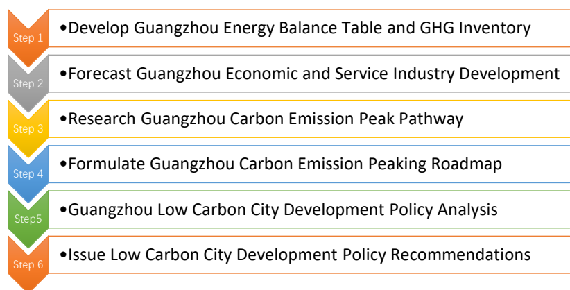
Figure 3: Guangzhou Green Energy Development Method Research 7

This planning is based on two national pilot policy directives issued by China’s National Development and Reform Commission: “Notice on the Pilot Work on Low Carbon and Low Carbon Provinces and Cities (2010)” 5 and “Notice on Launching the Second Batch of National Low Carbon Provinces Cities Pilot Projects (2012)” 6 . It takes into account other relevant urban plans and policies, and factors in social, economic and environmental impacts. The following image displays six steps in Guangzhou’s low carbon development planning workflow: