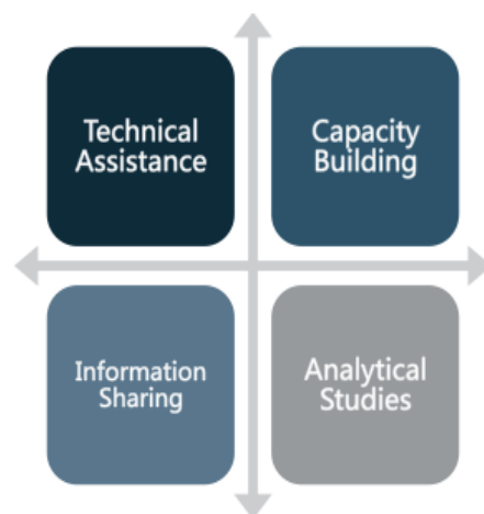
Figure 1: North-East Asia Low Carbon City Platform objectives

Peer reviews identify case-study cities, assess their low carbon urban development policies, and promote the sharing of insights among peers. This is done by organizing technical reviews, workshops and field visits by issue-area experts. Comparative studies provide a comprehensive and systematic overview of national approaches to low carbon city development. They identify good practices in specific sectors for information-sharing and promote cooperation on future policy efforts.