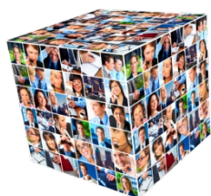
Pool of Experts

An online platform for LGs to provide proven solutions for low carbon / emission development