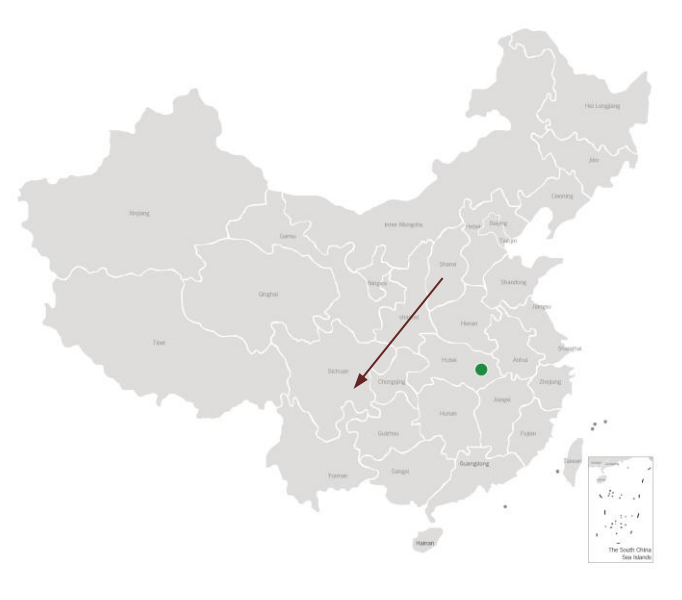
Wuhan, Hubei province

As an economic center and mega city in China's central region, with its particular geography and climate, Wuhan has long been an energyintensive city. However, given its high