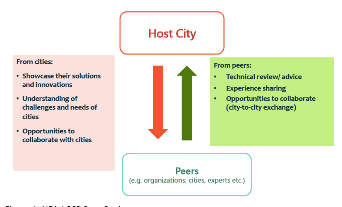
Figure 1. NEA-LCCP Peer Review

This Peer Review report supports the mission of the North-East Asian Subregional Programme for Environmental Cooperation's (NEASPEC) Low Carbon Cities programme. It is designed to promote NEASPEC's goals of enhancing coordinated actions to address subregional environmental challenges, mobilizing mutual support to manage domestic environmental issues in East Asia, and contributing to the implementation of national, regional and global goals for sustainable development. Meanwhile, as the following figure shows, it can facilitate low-carbon policy knowledge sharing and peer learning among peers from government, the private sector and research institutes of different cities.