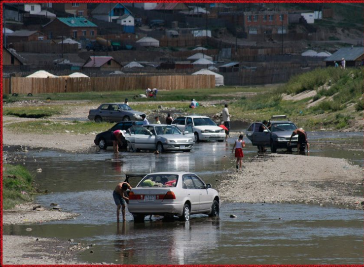
СЭЛБЭ Г0/1 2008 0Н