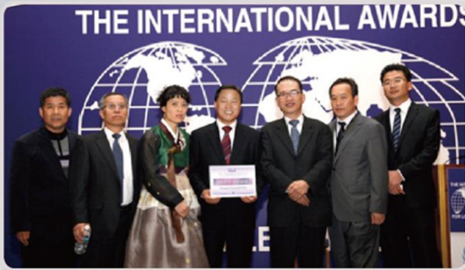
LivCOM Awards(살기좋은 도시대상) 은상 수상

창원의 자전거 정책은 세계와 UN에도 알려져 있습니다. 국무총리와 지방공무원과의 대화 한승수 국무총리 ('09. 4. 6)