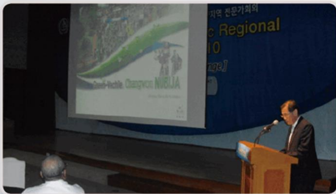
UN-HABITAT(유엔 인간정주위원회) 뉴비자 발표