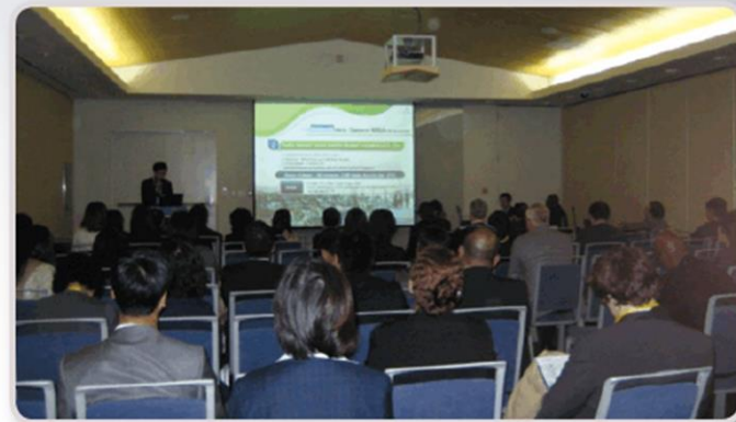
ICLEI(자치단체국제환경협의회) 세계총회 뉴비자 발표