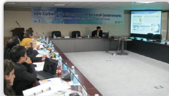
UNITAR(유엔훈련연구기구) 뉴비자 발표