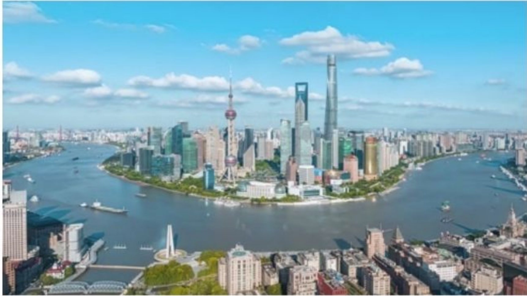
SHANGHAI 24 MILLION RESIDENTS

POPULATION 235 MILLION ≈ WORLD'S FIFTH BIGGEST COUNTRY PAKISTAN