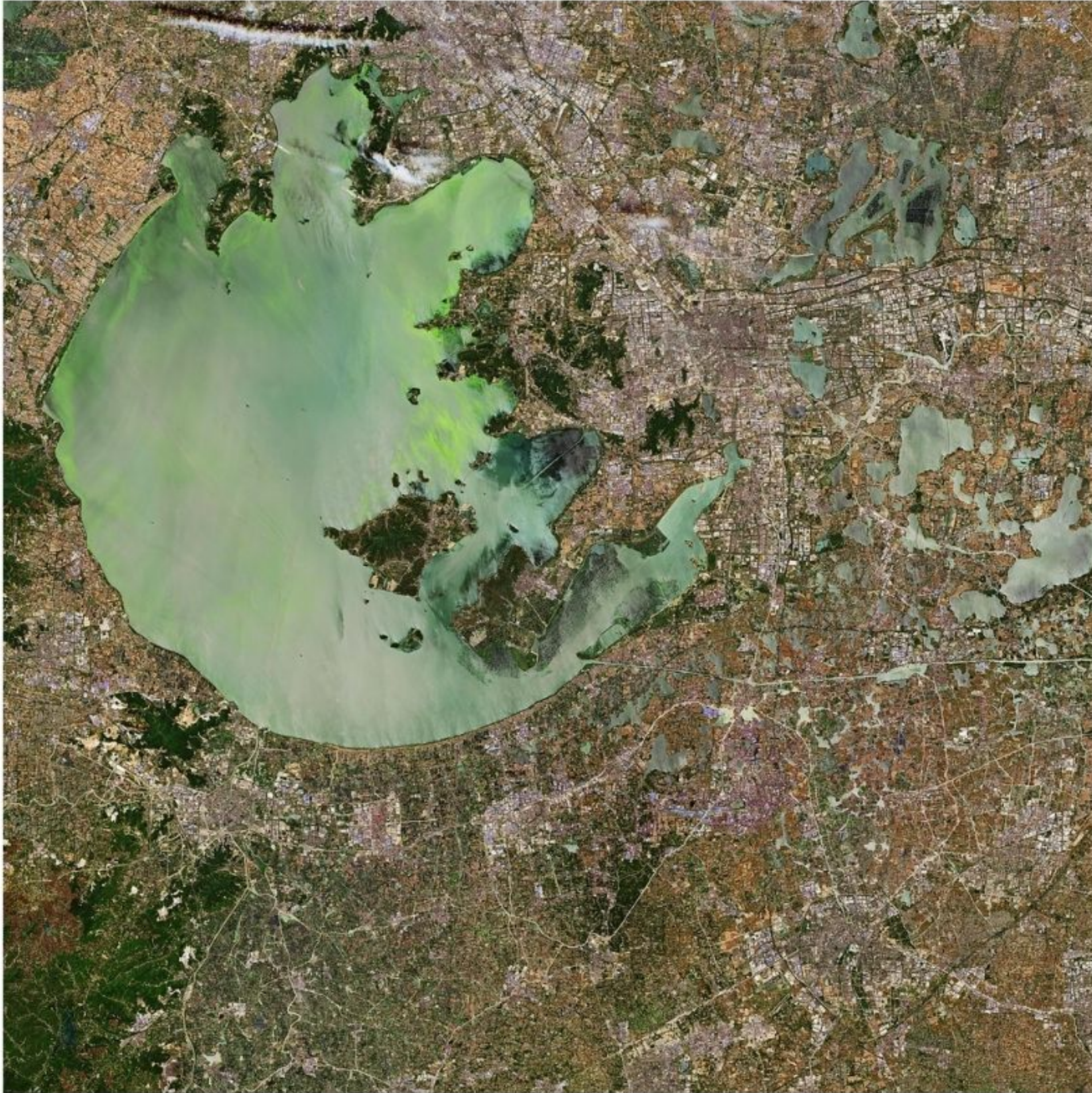
Taihu lake, the third largest freshwater lake in China, is vital for the region's agriculture, industry, and supply of drinking water.