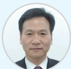
Mr. Park, Deok-soo Vice Mayor of Incheon Metropolitan City