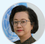
Ms. Armida Salsia Alisjahbana Under-Secretary-General of the United Nations and Executive Secretary of ESCAP