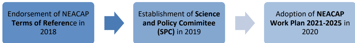
Figure 1. Institutionalization of NEACAP

2. NEACAP Work Plan 2021-2025 divides potential priority areas into Categories I and II. Category I refers to activities that can be initiated without specific intensive preparatory work and provide immediate benefits to member States. The priority area identified and agreed upon in this Category is “Policy and technology cooperation”. Category II pertains to activities that are of significant importance for developing scientific approaches to inform policy making. These activities require scientific and collaborative preparation, as well as the development of capacity of experts to initiate these activities. Methodological research in individual member States, focusing on (i) emission inventory and (ii) policy scenario and integrated assessment modeling, is considered a potential priority area within this Category. However, further discussions are needed to identify priority areas.